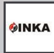
Industri Kereta Api (Persero), PT