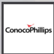
Conocophillips Indonesia Inc Ltd