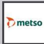
Metso Minerals Indonesia, PT