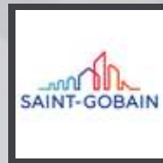
Saint Gobain, PT