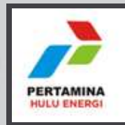
Pertamina Hulu Energi, PT